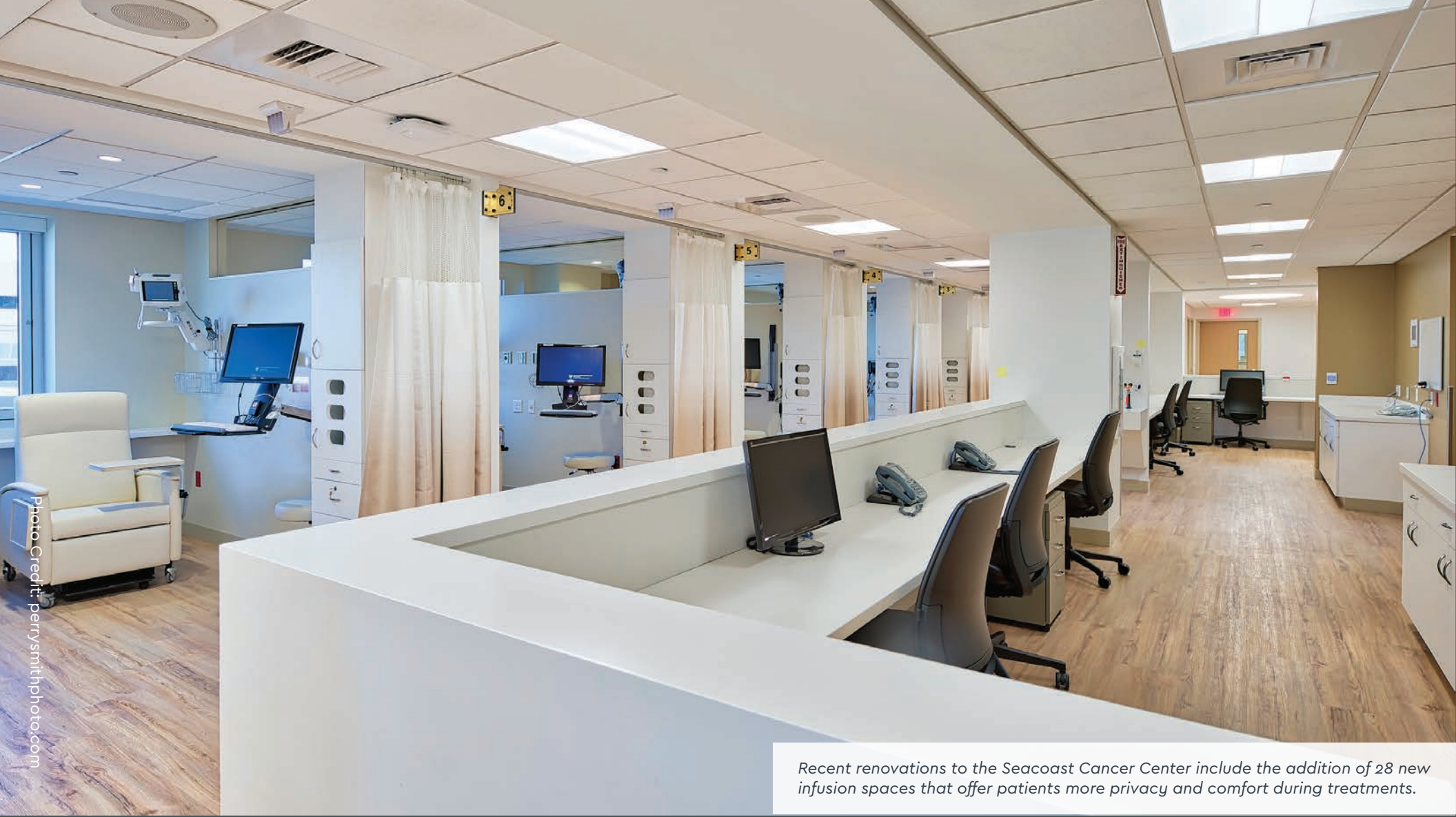
Recent renovations to the Seacoast Cancer Center include the addition of 28 new infusion spaces that offer patients more privacy and comfort during treatments.