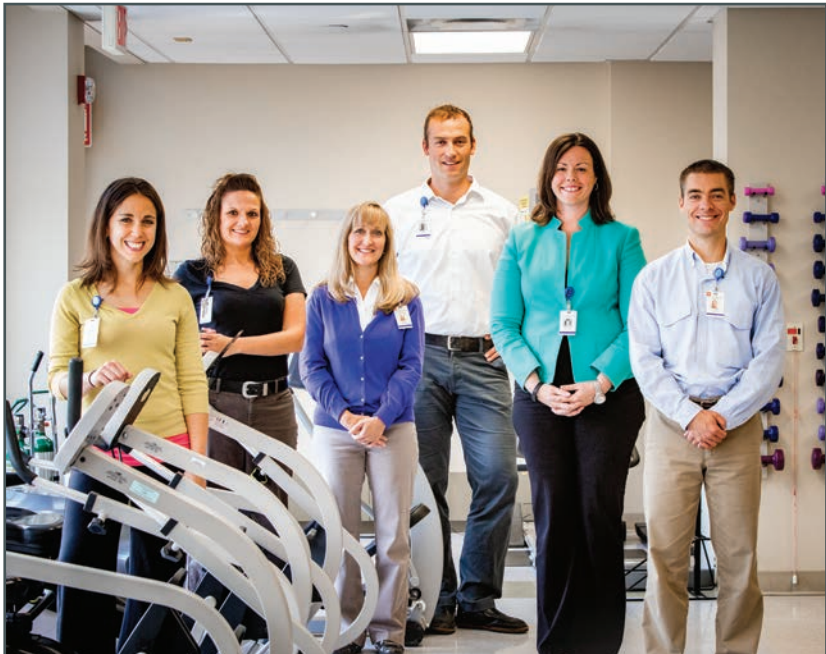
Wentworth-Douglass offers Rehabilitation Services at several convenient locations in Dover, Durham, Lee, and soon in Somersworth.