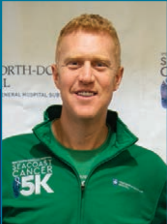
Meet Boston Hoops Champ Brian Scalabrine.

SUNDAY, SEPTEMBER 22 | 9:00AM | DOVER, NH SeacoastCancer5K.org