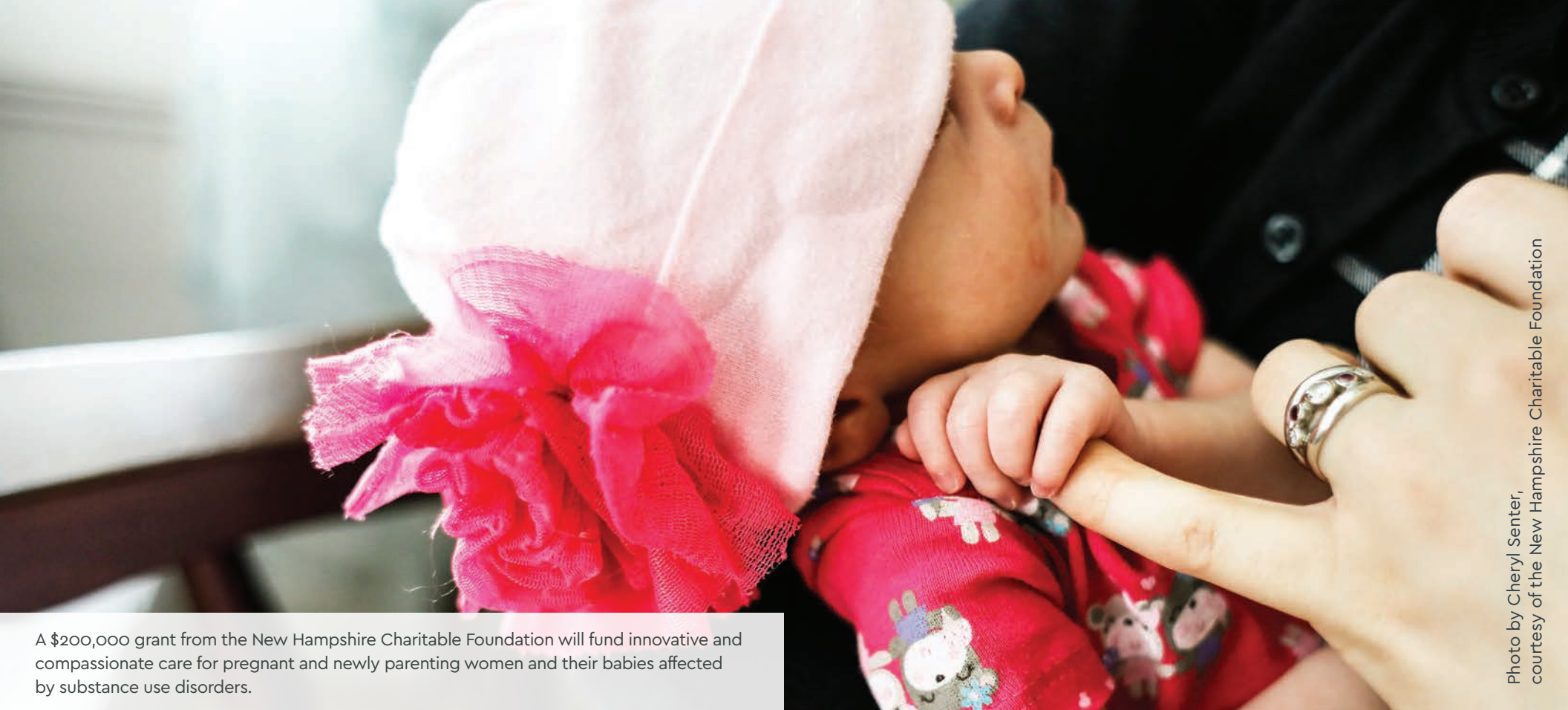
A $200,000 grant from the New Hampshire Charitable Foundation will fund innovative and compassionate care for pregnant and newly parenting women and their babies affected by substance use disorders.